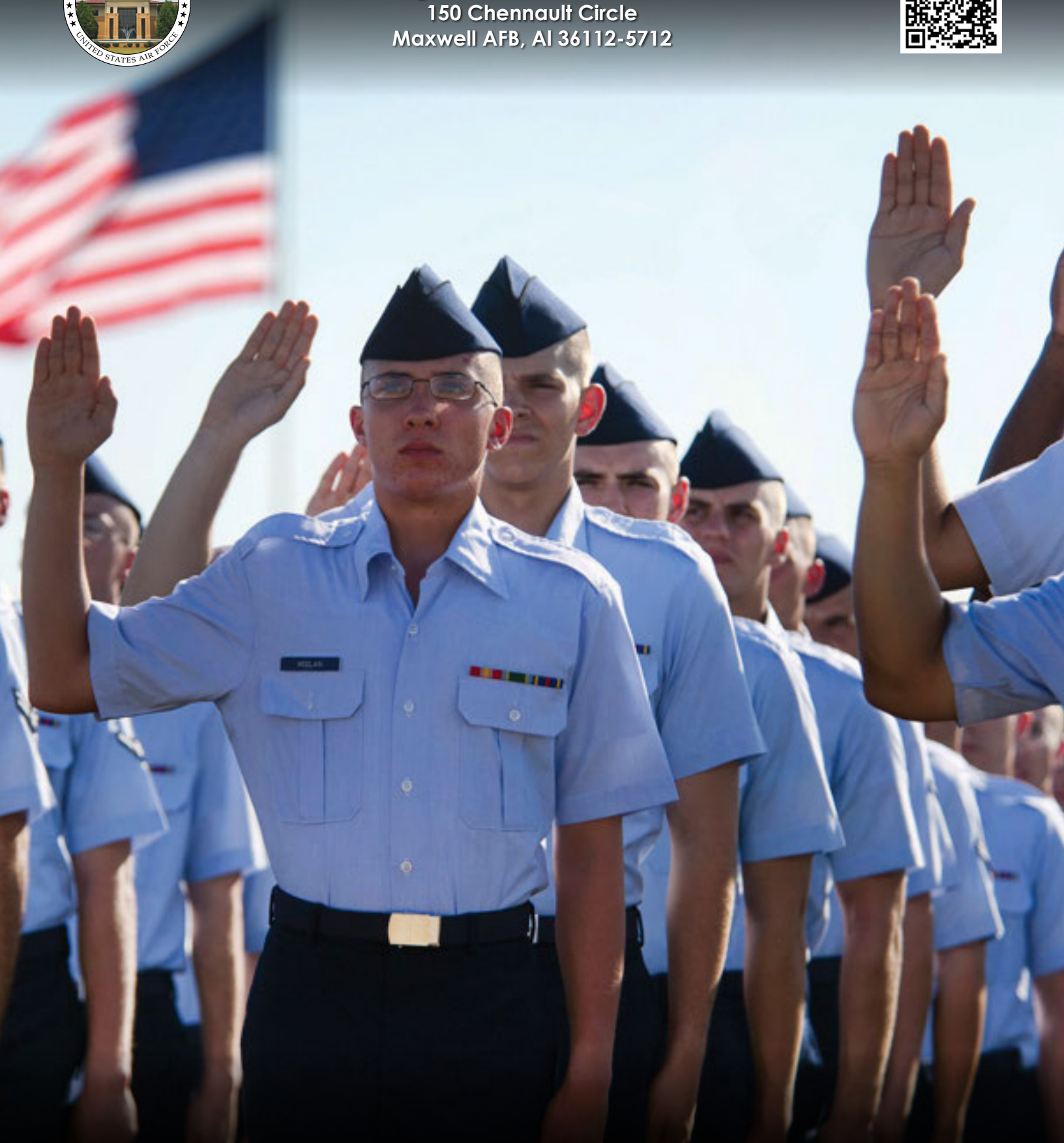
Basic Military Training—Where it all begins